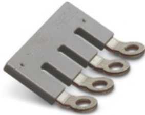
Insertion bridge, pitch: 11.1 mm, number of positions: 4, color: gray

Please be informed that the data shown in this PDF Document is generated from our Online Catalog. Please find the complete data in the user's documentation. Our General Terms of Use for Downloads are valid ( http://phoenixcontact.com/download )